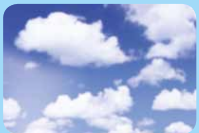
6. Window is left clean.