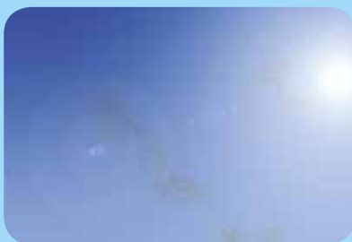
3. Reaction loosens organic dirt.