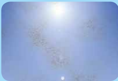
2. Daylight triggers the Pilkington Activ™ coating.