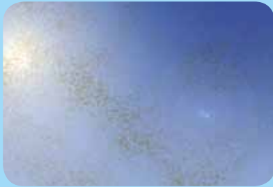
1. The window is exposed to daylight.