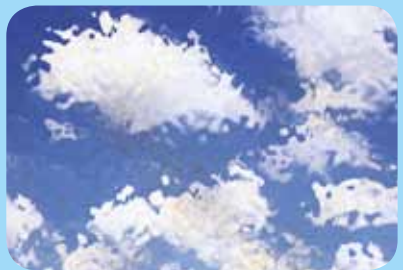
5. Dirt is washed away by rain.