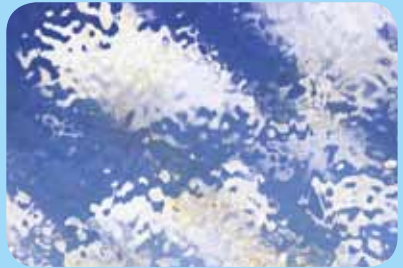
4. Rainwater hits window and sheets down glass.